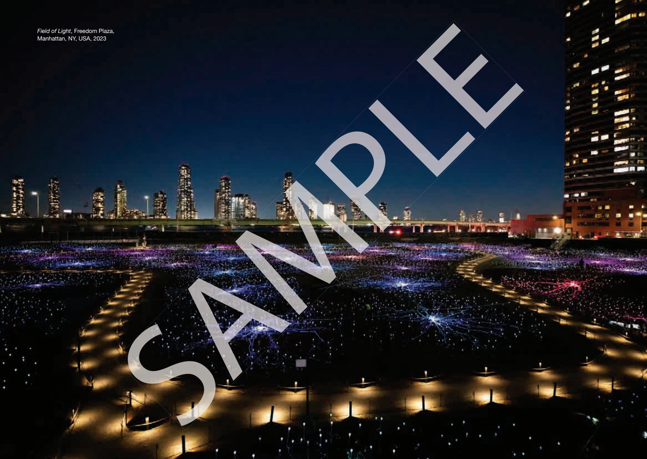
Field of Light , Freedom Plaza, Manhattan, NY, USA, 2023