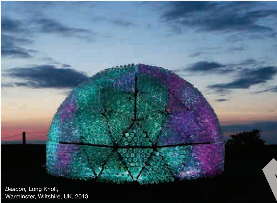
Beacon , Long Knoll, Warminster, Wiltshire, UK, 2013