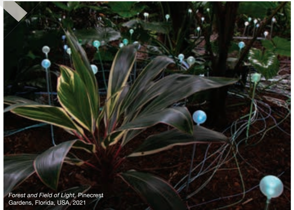
Forest and Field of Light , Pinecrest Gardens, Florida, USA, 2021